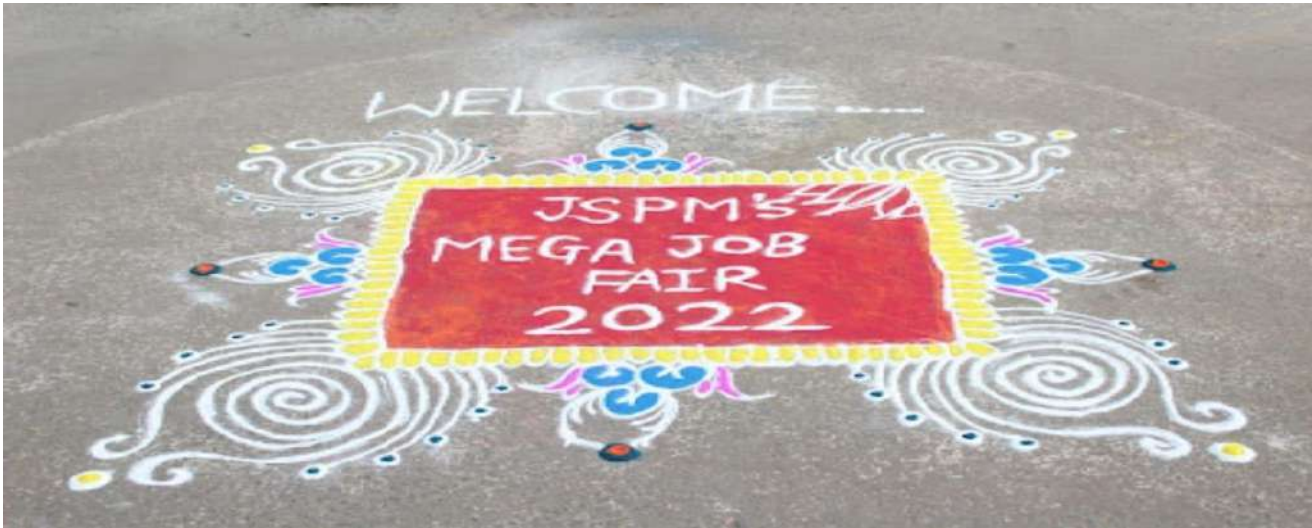
Mega Job Fair – Exposure to handle Major Events