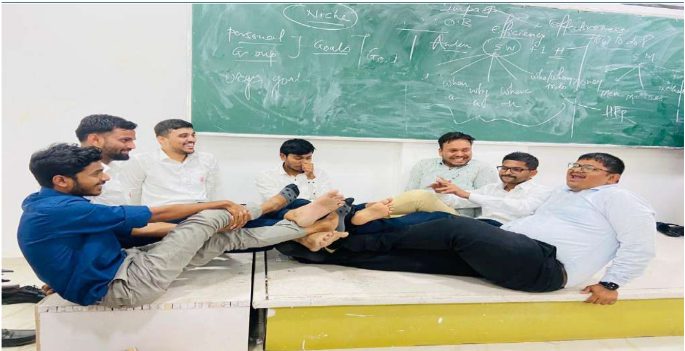
Team Building Games