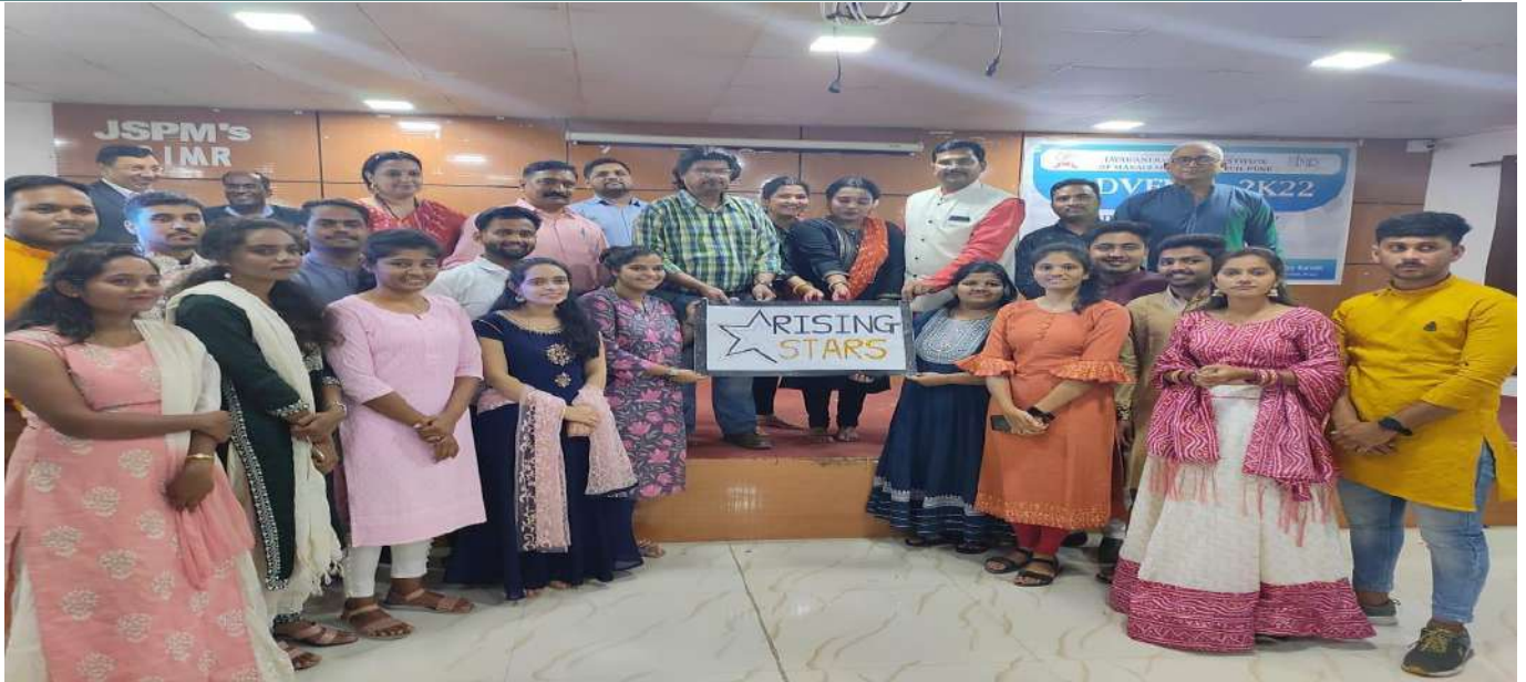
Every batch has a unique name MBA batch 2022 named "Rising Star"