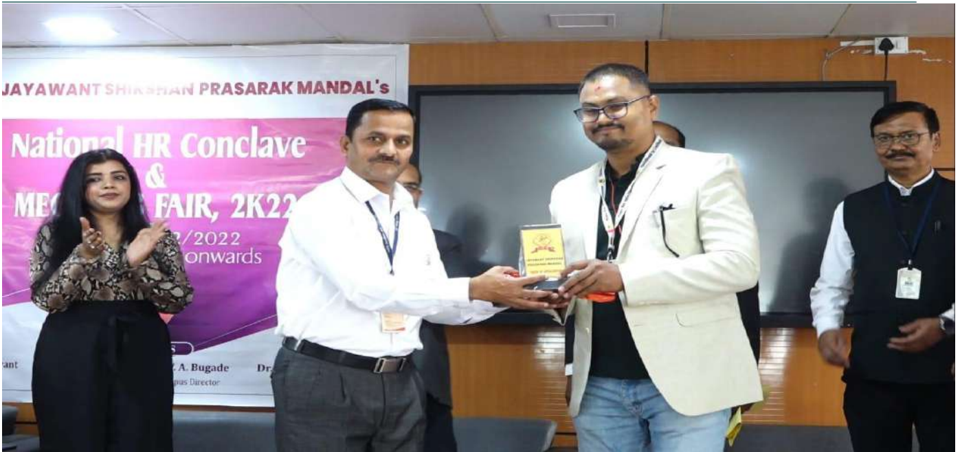
National HR Conclave